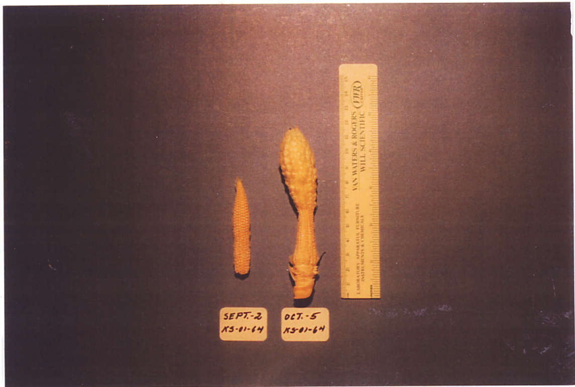
Fig.1-B Ear re-growth at the apex of a formation sample showing an earlier suppression of embryo growth.